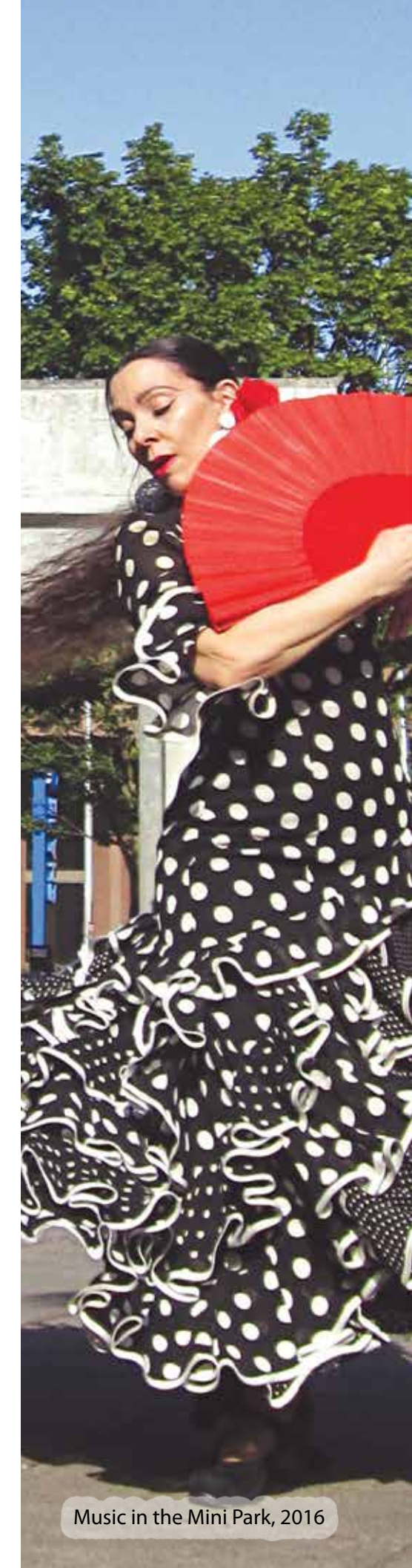
Music in the Mini Park, 2016