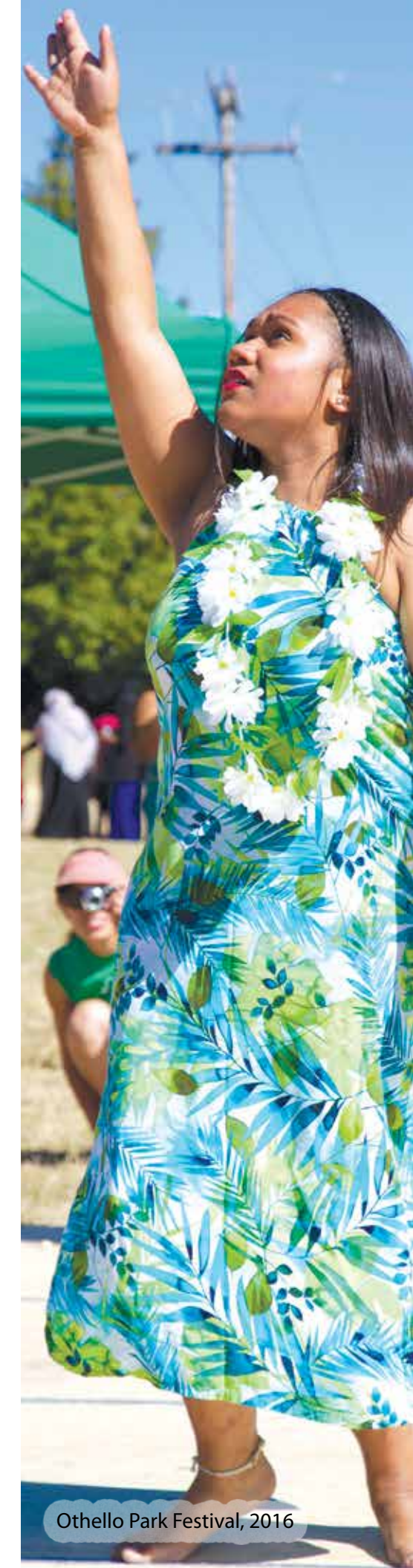
Othello Park Festival, 2016