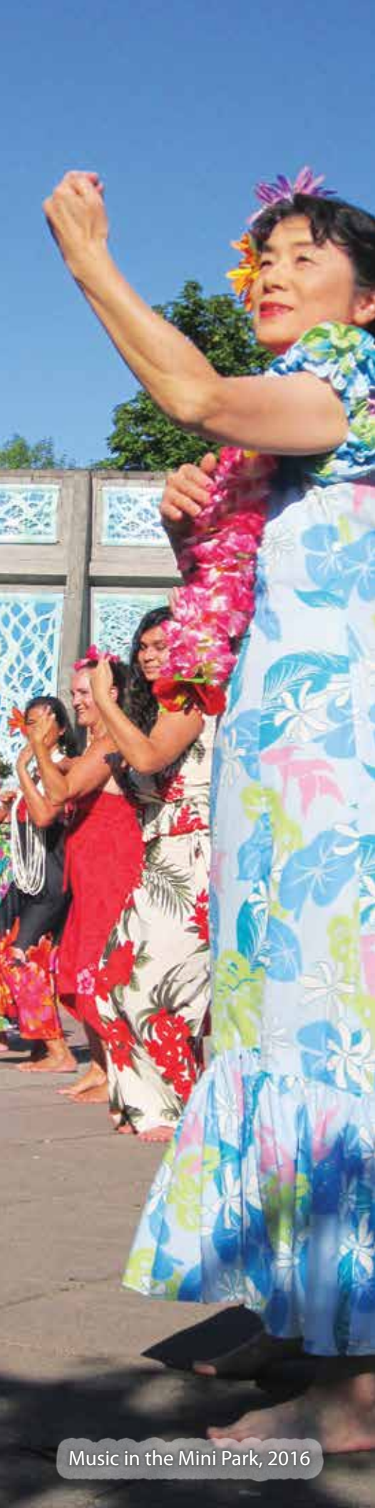
Music in the Mini Park, 2016