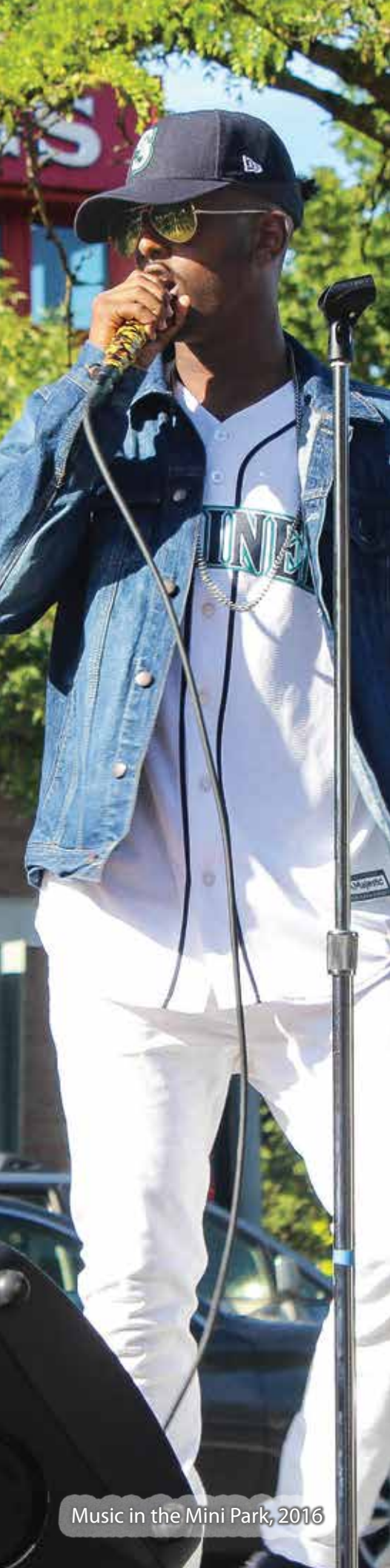
Music in the Mini Park, 2016